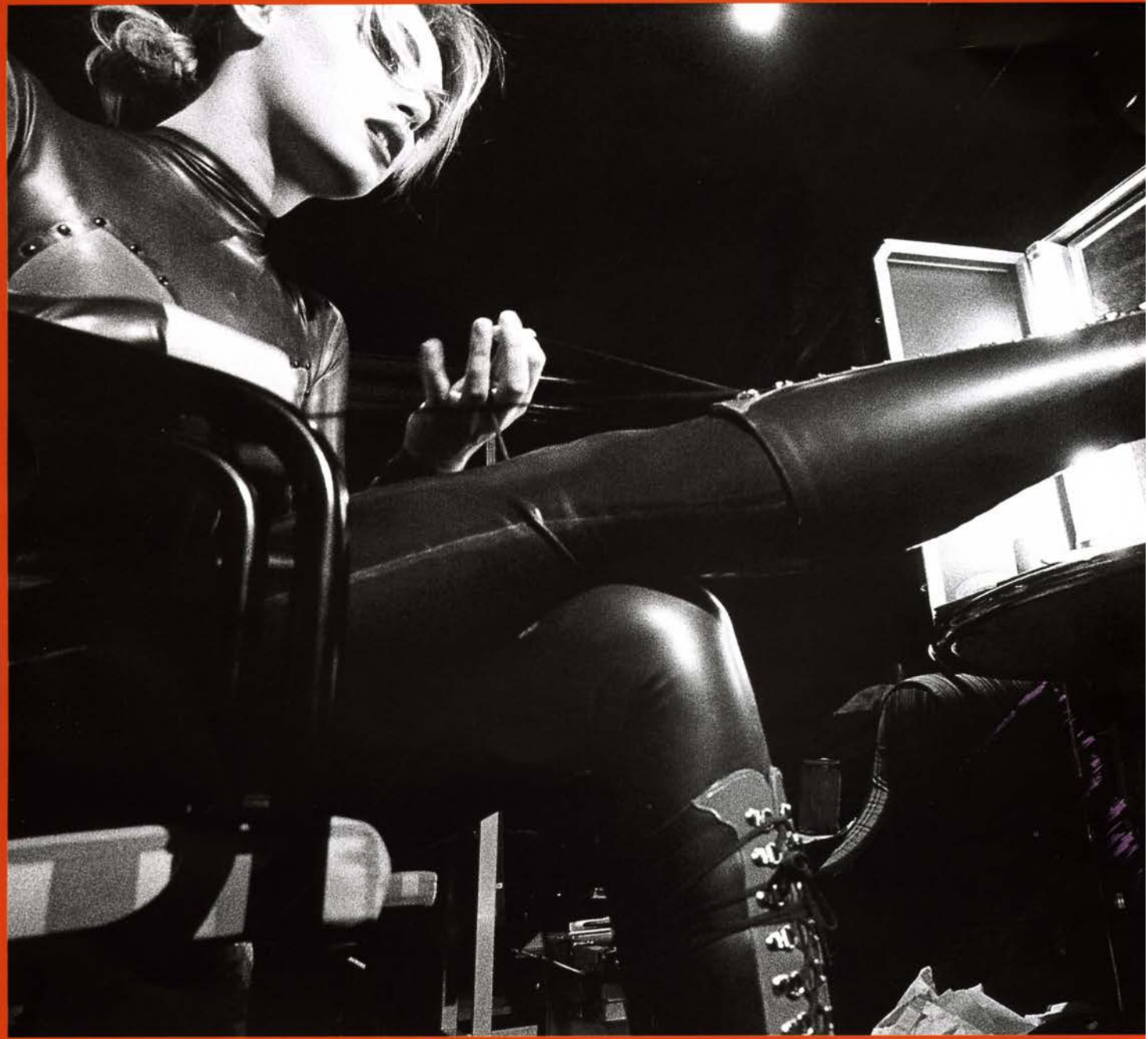
Above and below: some last minute lacing-up before the Libidex and Ectomorph segments of the fashion show go on the road